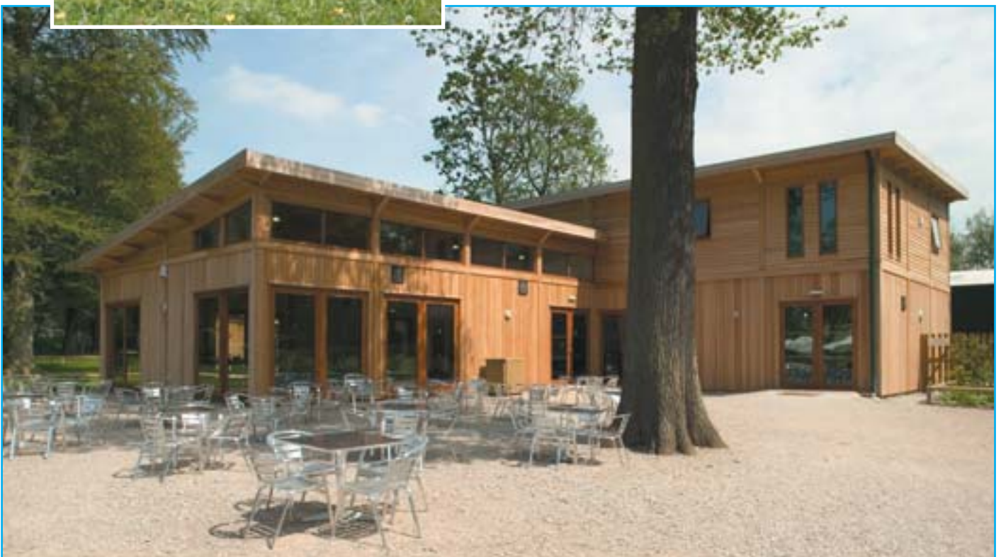
The Main Building, Banana Cafe and Jungle Shop

Both are of timber frame construction, externally clad in tongue and grooved Siberian larch, derived from sustainable forests. Slow growing, close-grained larch is very durable and requires no preservatives or coatings. It ages naturally over time, turning silvery grey, an appropriate colour for this woodland setting. Both buildings have a low pitch roof clad in