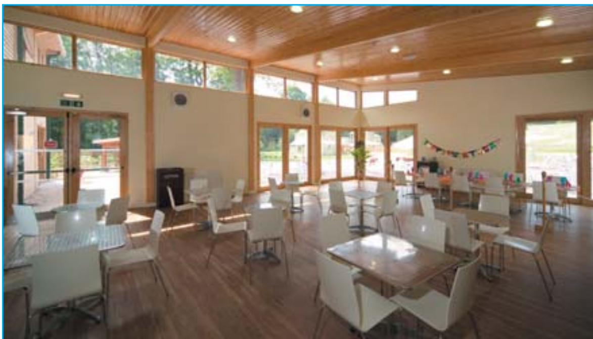
The interior of the Banana Cafe